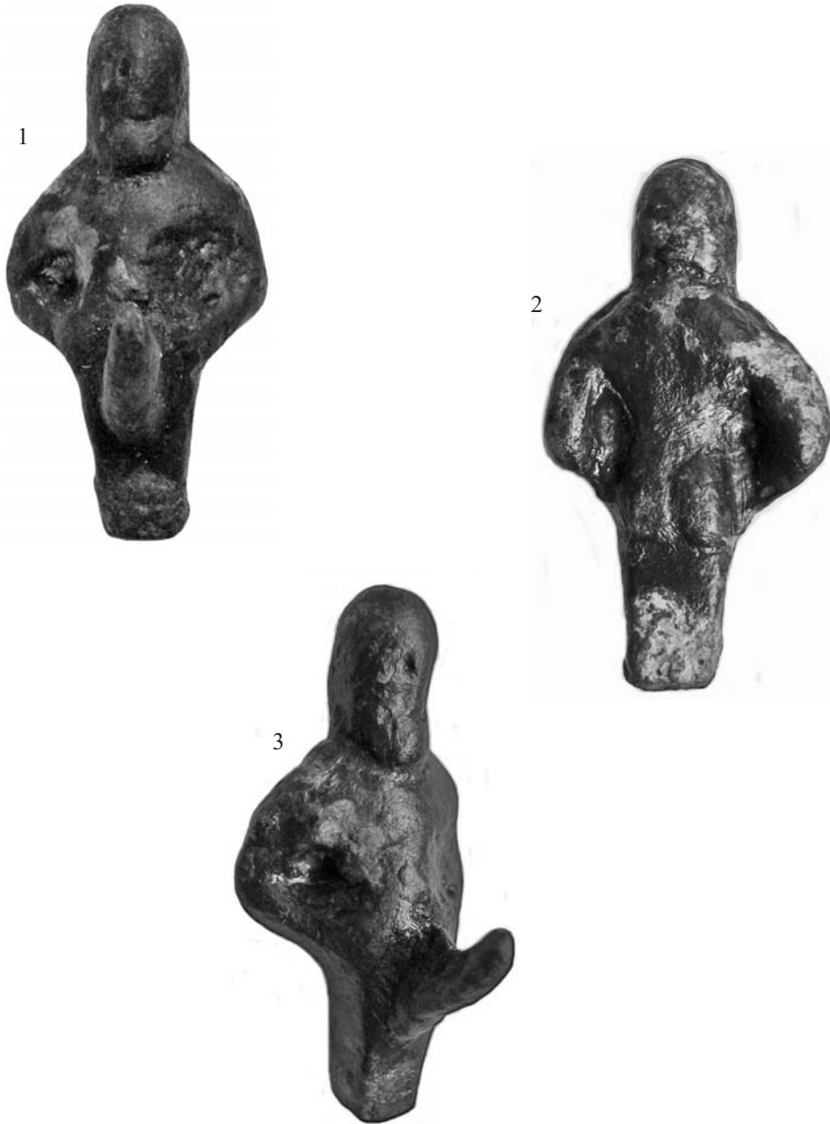
Pl. 2. Herm of Priapus